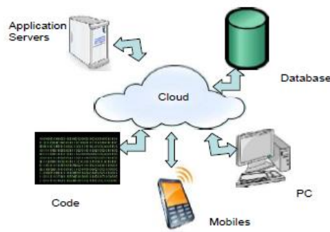
Fig. 1 A Cloud Computing Environment

A consumer can unilaterally provision computing capabilities, such as server time and network storage, as needed automatically without requiring human interaction with each service's provider.